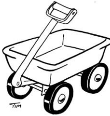
2020 Food Collected for Food Pantry by TCC

Please help us to support our Food Pantry by remembering to bring non-perishables each week. You can place your food donations into our “food pantry wagon” when it is pulled down the aisle during morning announcements.