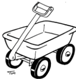
2020 Food Collected for Food Pantry by TCC

Please help us to support our Food Pantry by remembering to bring non-perishables each week. You can place your food donations into our “food pantry wagon” when it is pulled down the aisle during morning announcements.