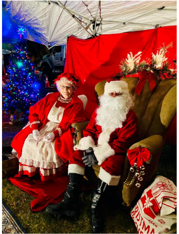
PHOTO: December 3, 2021 – Town of Plymouth Tree Lighting at Plymouth Green

Terryville Congregational Church December, 2021 NEWSLETTER 233 Main Street Terryville, CT 06786 USA