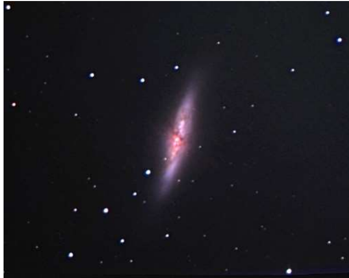
Info for Photo: Galaxy M82 in the Big Dipper located 30 million light years away.