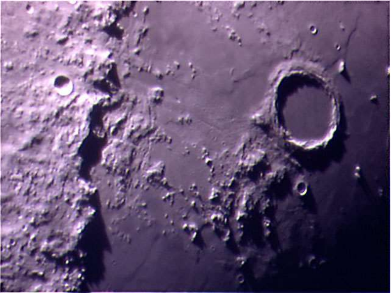
Image Data: A highly detailed image of the lunar Apennines mountains and the crater Archimedes. Imaged with the observatory's 10-inch telescope.

Come join the fun of a tour of our moon closeup. We will observe the moon visually using a 4-inch-high Quality telescope and observe the moon using the large 10-inch telescope with a video camera attached and study in detail craters, mountains, valleys, and strange cracks on the surface called rills, all on a full screen where we can "walk" around the lunar surface and see named craters and other features. Some lunar history will also be presented, centering on the observers of the 1800's who made hand drawn maps of the moon which will be explained. All are welcome and I encourage you to bring young children who show an interest in science, but all students are welcome. Sometimes a new journey is started with that first look through an astronomical telescope.