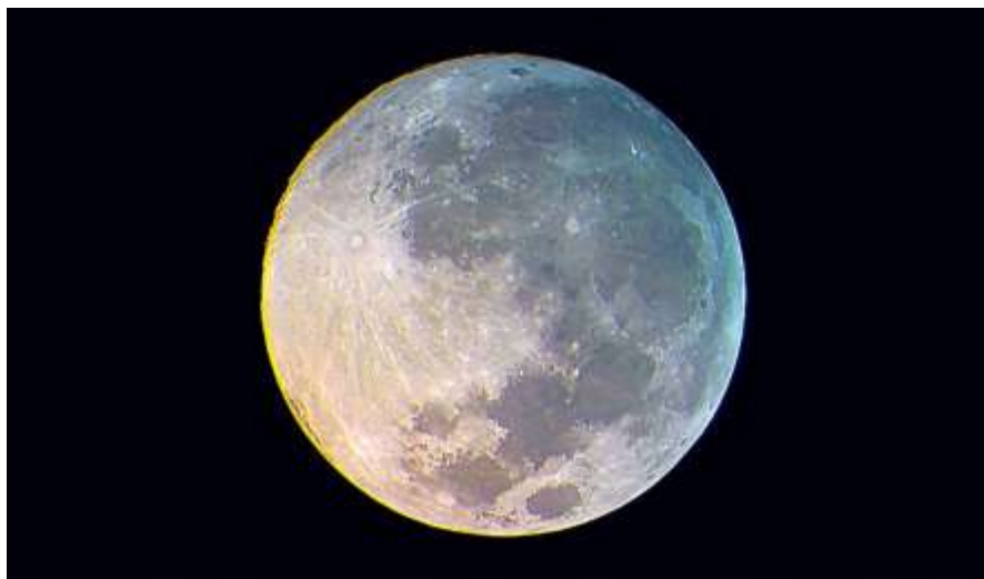
Full Moon Our moon at full phase in all its glory. (All images, Haven Above Observatory images.)