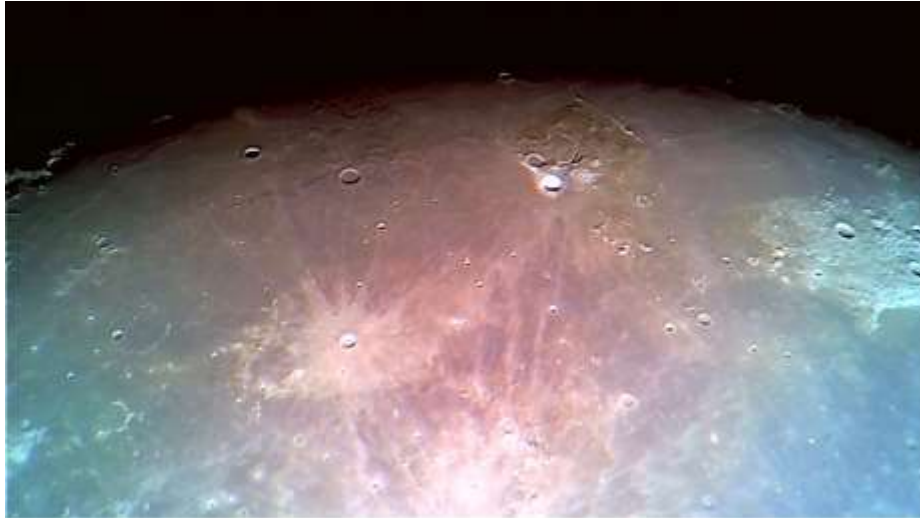
Enhanced color version: The beautiful crater Kepler with its expansive ray pattern and the strange Marius Hills.

Touring the moon has been rescheduled for Monday June 17 or cloud date of the 18th. The change to a Monday night is a result of the lunar position. But the moon being a bright object observing can be started at twilight which will offset the Monday problem. If needed the dates could change due to weather.