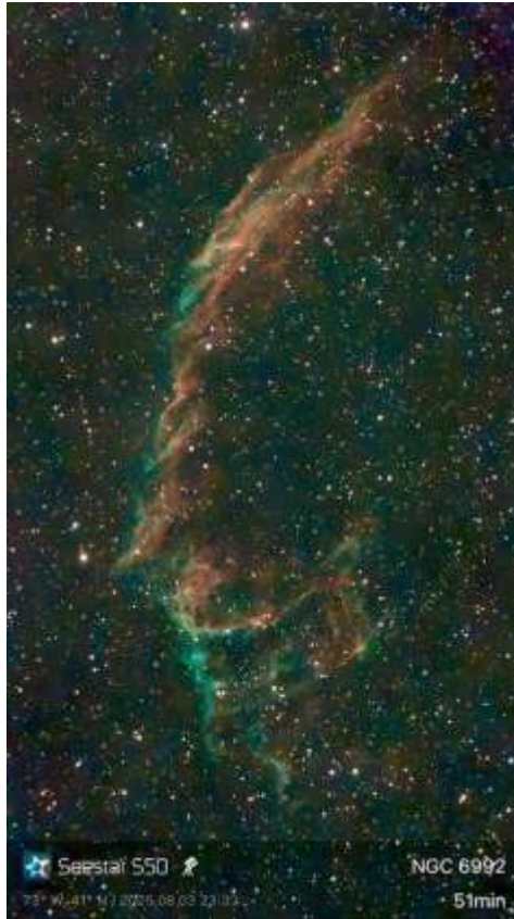
Photo info: The nebula complex known as NGC6992 Located 1500 light years away. This nebula region is the result of a Super Nova explosion.

Havens Above Observatory